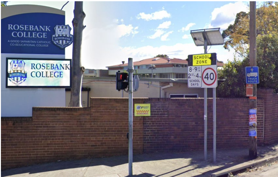
Photograph 1 – South east wall which has been altered and intrusive.