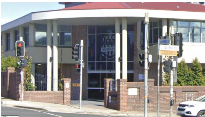
Photograph 4 – Harris Road and Queens Road entry gate