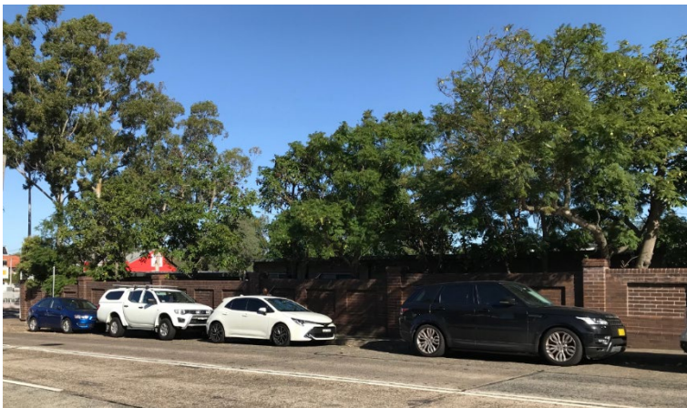
Photograph 2 – Harris Road Elevation , shows height of wall and trees