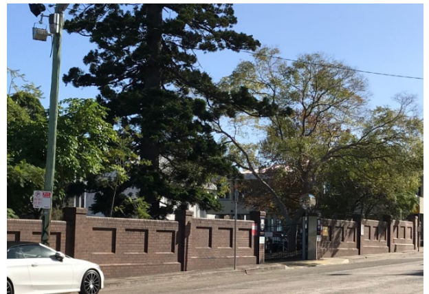
Photograph 3 – Harris Road entry